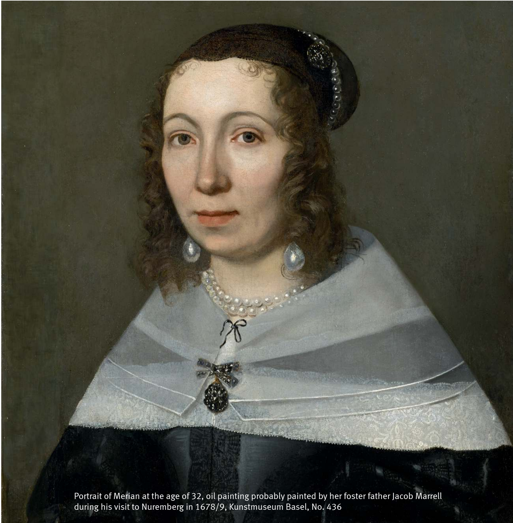
Portrait of Merian at the age of 32, oil painting probably painted by her foster father Jacob Marrell during his visit to Nuremberg in 1678/9, Kunstmuseum Basel, No. 436