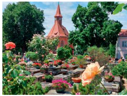
Rosen auf dem Johannisfriedhof